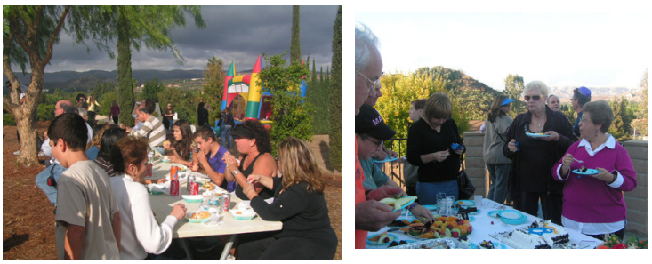
A celebration always calls for food.