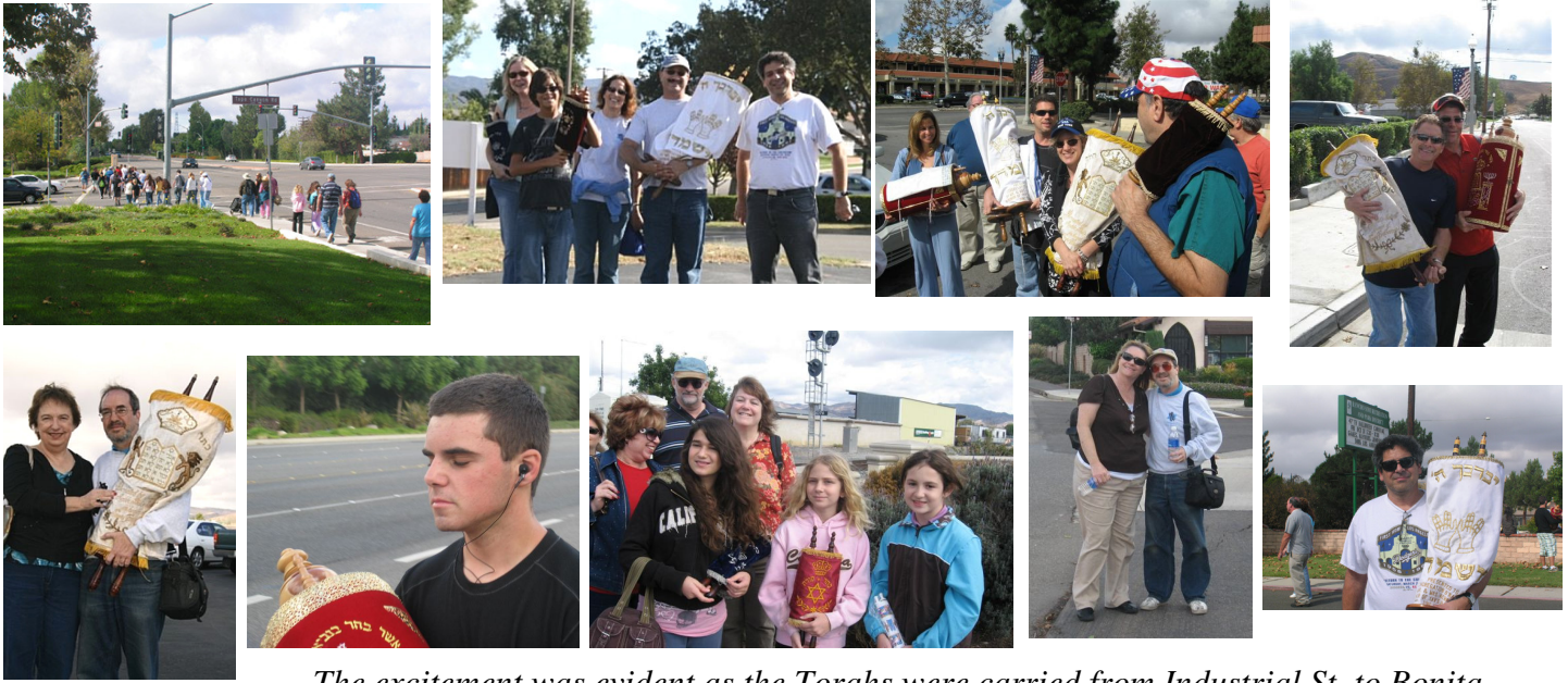
The excitement was evident as the Torahs were carried from Industrial St. to Bonita.