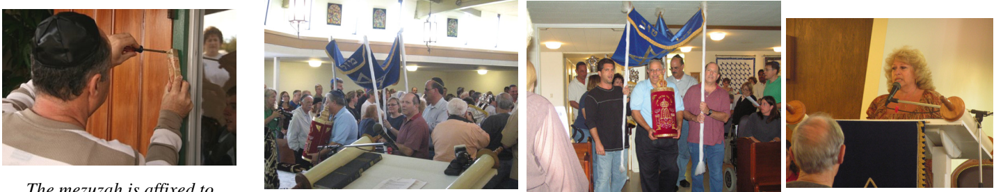
The mezuzah is affixed to the doorpost