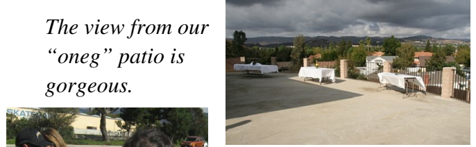
The view from our "oneg" patio is gorgeous.